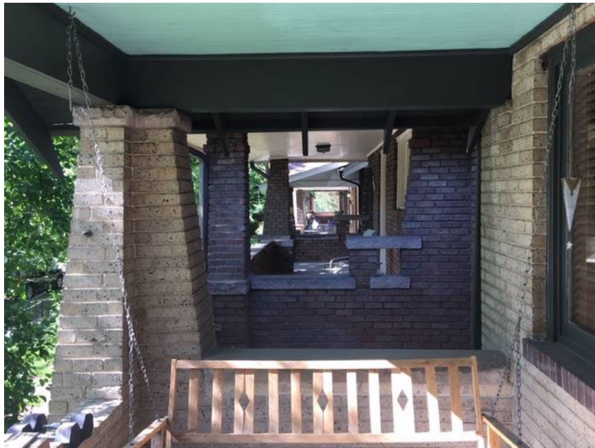
Figure 1 The Bungalow porches present physical and design-based connectivity up and down Steele Street