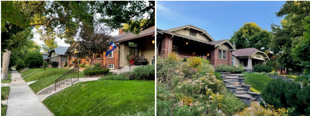
Figure 2 The proposed historic district maintains its historic character, with the houses maintaining their historic style, setback, and sense of scale

style include low-pitched gabled or hipped roofs, wide, overhanging eaves, often with exposed rafter tails, ridge beams, or knee braces, and full- or partial-width porches with substantial square or tapered piers supporting the porch roof. The bungalows in the proposed district were constructed between 1915 and 1924, at the height of the style's popularity in Denver. The only homes not built in the bungalow style include one Foursquare and one Central Passage Double Pile, but these two homes were built within the period of significance, and their brick construction and setbacks blend neatly with their Bungalow neighbors. There is one building that is considered non-contributing to the district: 716 Steele Street was constructed in the Craftsmen style, however, a fire in the 1980s required extensive remodeling, which impacted the integrity of the original design.