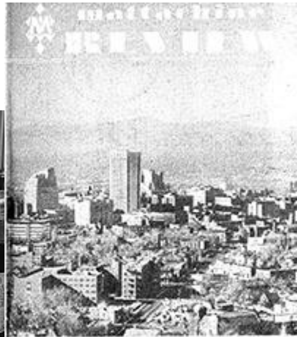
6th Annual Convention Mattachine Society, Inc. Hotel Albany--Denver, Colo. September 4-7, 1959 (Detailed program inside)